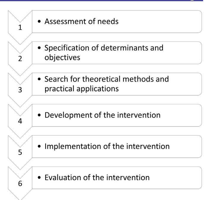
Figure 2 The six steps of the intervention mapping framework.

The data collection takes place during the period 2020–2024 (see figure 1). For development of the toolbox, the six steps of the intervention mapping (IM) framework are followed: (1) assessing the needs of the target group, (2) specifying the problem and its determinants into change objectives, (3) selecting theoretical intervention methods and practical applications for change, (4) designing and developing the intervention, (5) implementing the